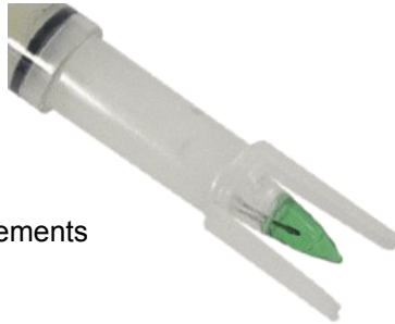
Sleeve for measurements in liquid samples

Glass elements of the electrode are protected by a plastic body. Plastic sleeve which protects the junction is an integral part of the electrode. It is impossible to use the electrode without the sleeve. The sleeve may be exchanged and it's kind depends on the type of the measured sample.